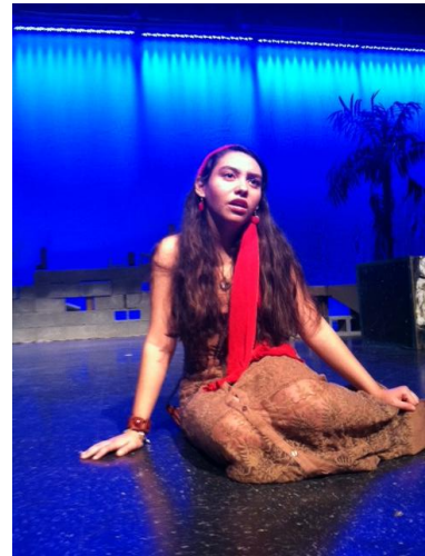
Cast of Jesus Christ Superstar