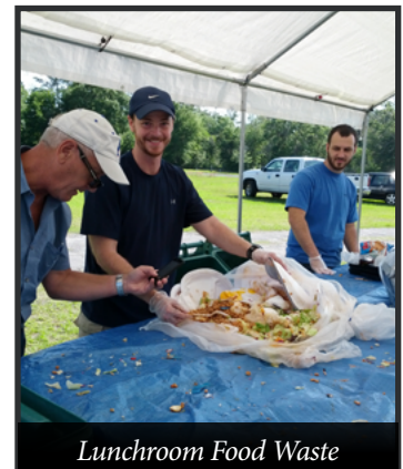
Lunchroom Food Waste