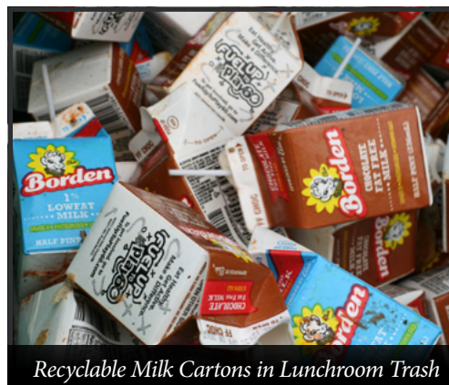
Recyclable Milk Cartons in Lunchroom Trash