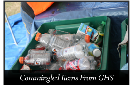
Commingled Items From GHS

Glass, metal, plastic and cartons represented 15% of the waste collected from the audited schools. A large amount of these materials came from lunchrooms and the kitchens. Commingled recycling bins with proper signage should be placed in the cafeterias, teachers lounges and kitchens to collect these items. Commingled bins should also be placed in conjunction with waste bins throughout the school to maximize the opportunity to recycle commingled containers.