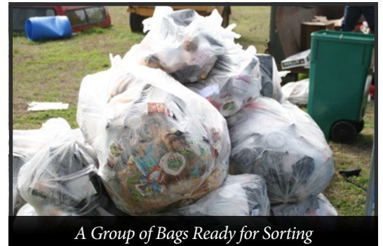
A Group of Bags Ready for Sorting

The data is then entered into a spreadsheet that will calculate the total weights of the groups and categories and the total recycling potential by weight and volume for the school.