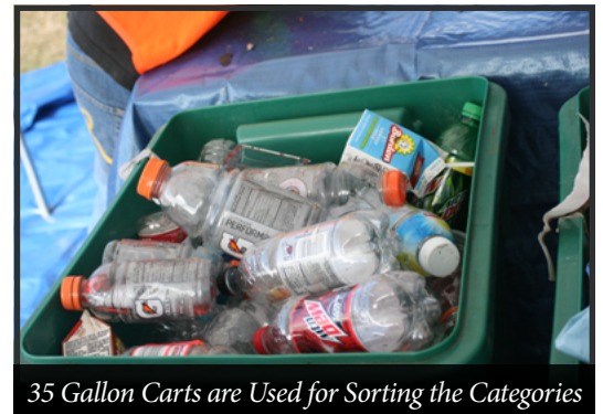
35 Gallon Carts are Used for Sorting the Categories