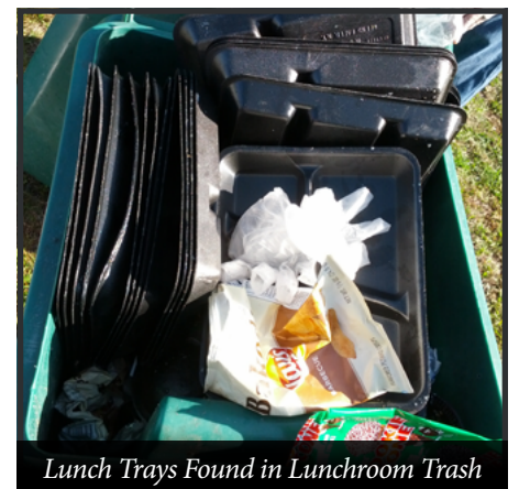
Lunch Trays Found in Lunchroom Trash

Implementing a comprehensive recycling program including paper, plastics, metal, glass and cartons can significantly reduce the amount of solid waste sent to the landfill from Alachua County schools. This reduction in waste can also reduce the size and tipping frequency of containers. In many cases an entire solid waste container can be replaced by containers for recycling. School waste audits also showed a significant amount of plastic foam trays used for lunch that are thrown away. Some schools are already recycling these trays using a "Whack and Stack" method of collection and then processed in a compactor that removes the air from the foam.