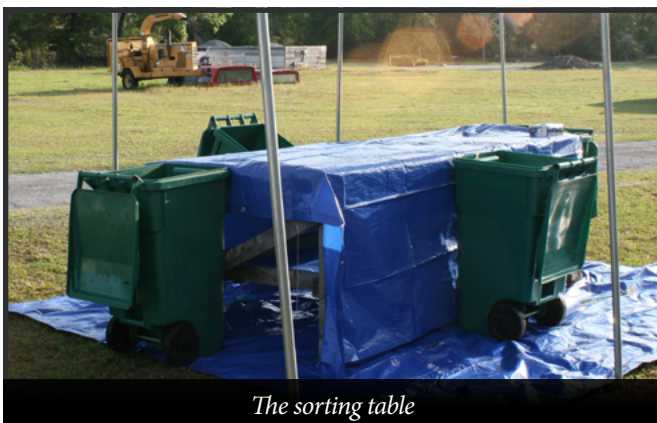
The sorting table