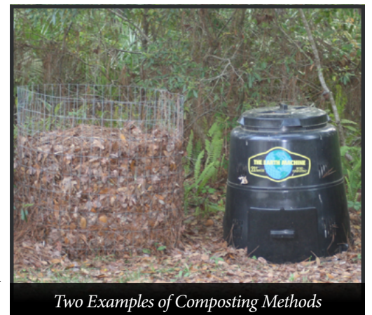
Two Examples of Composting Methods

Currently no large-scale commercial option exists for composting post-consumer food waste, but there are other ways to divert food waste. Santa Fe High School is working with a local pig farmer who takes the kitchen organics for use as pig feed. Schools with space can also start a pilot composting program on site in conjunction with a school garden.