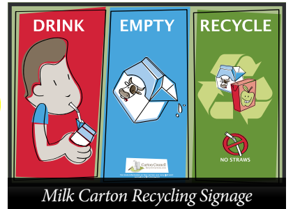
Milk Carton Recycling Signage

Milk cartons were especially prevalent in the waste from elementary school lunchrooms and are now part of the county's recycling program. Several milk cartons were found that had not been opened and many with some milk left inside. Emptying the containers before placing them in a recycling bin can help to reduce mess and odors. Placing signs (pictured right) can help students recycle cartons correctly.